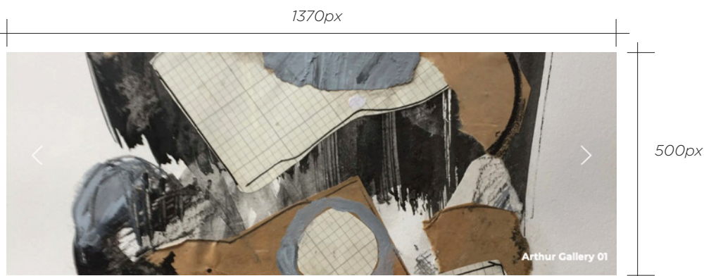
Gallery carousel image showing Landscape orientation

Gallery pages have a larger format image carousel and a 'sidebar' image. The carousel image dimensions are 1370px x 500px (images display with the full width of the image at 1370px, and are cropped top and bottom if the image exceeds 500px in height). It is therefore best to select images that have a strongly horizontal orientation or, if possible, crop them to 1370px x 500px ensuring that they are still high resolution and are 2-10mb (see example below).